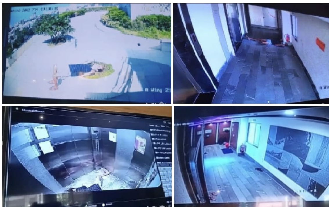
Fig. 1 Four falls. Left upper panel, sitting in the compound. Right upper panel, waiting for the elevator. Left lower panel, inside the elevator. Right lower panel, while leaving the elevator

AVNRT is the most common supraventricular tachycardia. Patients with AVNRT most commonly present with palpitations, sweating, dyspnea, and lightheadedness.